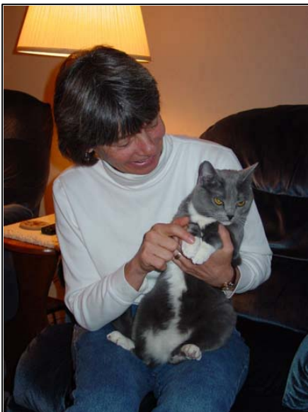
Acupressure Training

Acupuncture should never be administered without a proper veterinary diagnosis and an ongoing assessment of the patient's condition and response to any prior treatment. This is critical because acupuncture is capable of masking pain or other clinical signs and may delay proper diagnosis once treatment has begun. Elimination of pain may lead to increased activity on the part of the animal, thus delaying healing or worsening the original condition.