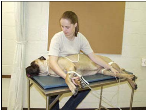
Gentle restraint is usually all that is necessary for acupuncture in pets.

Because of the differences in anatomy, and the potential for harm if the treatments are done incorrectly, only a properly trained veterinarian should perform acupuncture on animals. The American Veterinary Medical Association and the Canadian Veterinary Medical Association both consider the practice of acupuncture to be the practice of veterinary medicine, and as such, should only be performed by a licensed veterinarian.