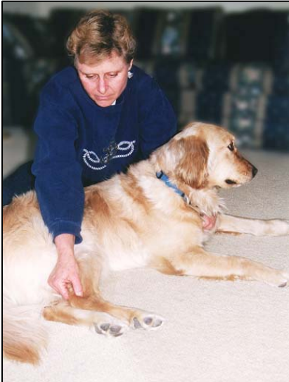
Acupressure Training

The term acupuncture is from the Latin, “acus” meaning ‘needle’ and “punctura” meaning ‘to prick’. Acupuncture, in its simplest sense, is the treatment of conditions or symptoms by the insertion of very fine needles into specific points on the body in order to produce a response. Acupuncture points can also be stimulated without the use of needles, using techniques known as acupressure, moxibustion, cupping, or by the application of heat, cold, water, laser, ultrasound, or other means at the discretion of the practitioner.